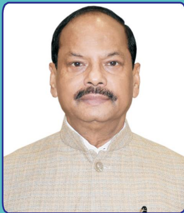
His Excellency Shri Raghubar Das

Hon'ble Governor of Odisha and Chancellor of Utkal University