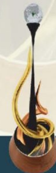
MEMBER SECRETARY, NBA